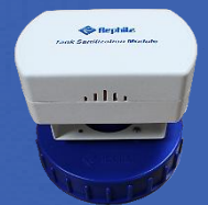
UV Sanitization Module

Good Production Technique ● Best Raw Material ● Thoughtful Designs